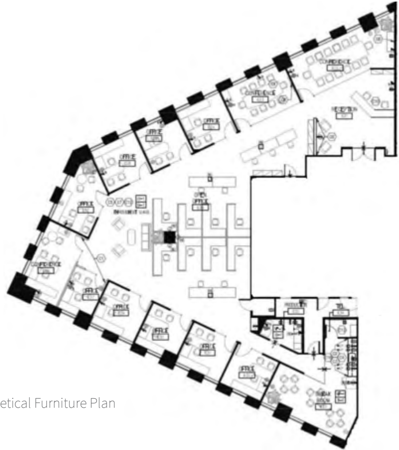
*Hypothetical Furniture Plan